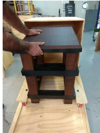
Step 3: Remove the table carefully and place it in the final place where it will be installed