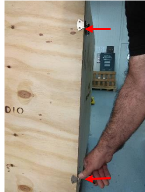
Step 1: Open and lower the front cover