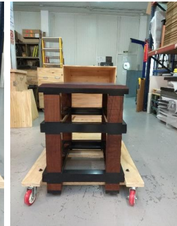
Step 4: Once in place, follow the steps below to unpack the transport base.